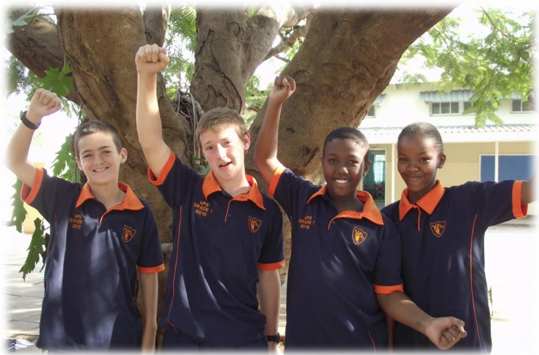
Our Winning Mathematics Team!

In 2015, Our Mathematics team won first and third place against 307 top Mathematics students in Swaziland!